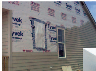
Fiber Cement Siding to Steel