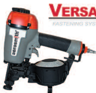
VersaPIN™ Tool (ST-4200)

Aerosmith Fastening Systems 5621 Dividend Road, Indianapolis, IN 46241 Ph: 317.243.5959 Fax: 317.390.6980 Toll Free: 800.528.8183 Email: info@aerosmithfastening.com