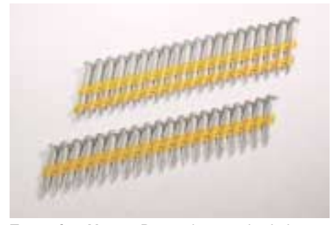
Fastening Notes: Determine required pin length based on achieving 3/4" - 1" penetration into the concrete. Space pins 12" apart.

Shank Diameter = .145" Head Diameter = 5/16" Zinc Galvanized