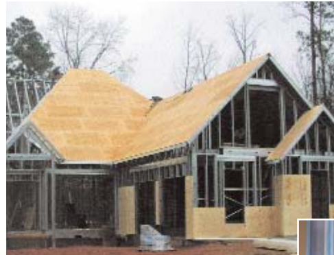
Plywood/OSB to Steel

VERSAPIN™ FASTENING SYSTEM One Tool for a World of Steel