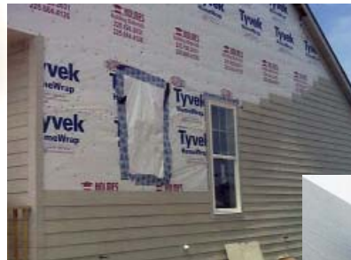
Fiber Cement Siding to Steel