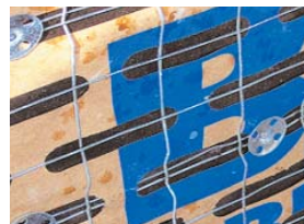
Steel Lath/Foam Board to Steel