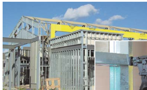
DensGlass® / Gypsum Sheathing to Steel