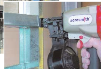
Cold-Formed Steel to Steel Framing