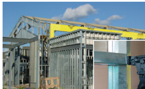
DensGlass® / Gypsum Sheathing to Steel