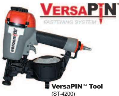
VersaPIN™ Tool (ST-4200)