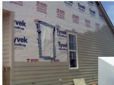
Fiber Cement Siding to Steel