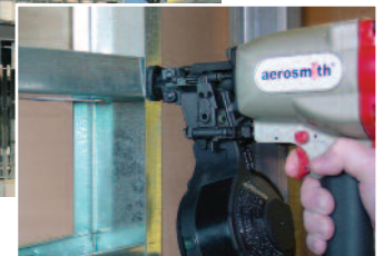
Cold-Formed Steel to Steel Framing