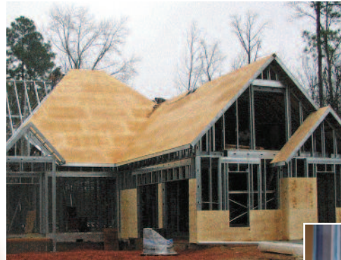
Plywood/OSB to Steel

VERSAPIN™ FASTENING SYSTEM One Tool for a World of Steel