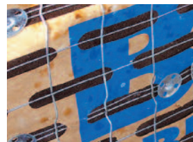
Steel Lath/Foam Board to Steel