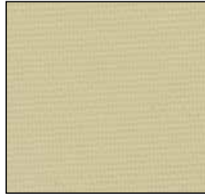
No-Lite Fiberglass Solid Champagne 170