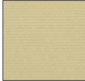
No-Lite Fiberglass Duplex Cameo 047