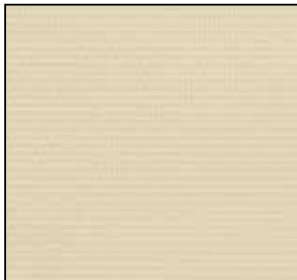
No-Lite Fiberglass Solid Oyster 003