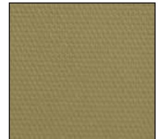
No-Lite Fiberglass Duplex Coffee 217