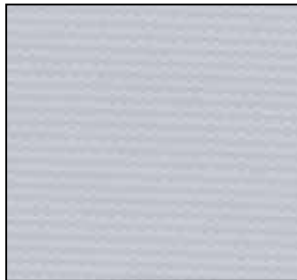
No-Lite Fiberglass Solid Cloud 904