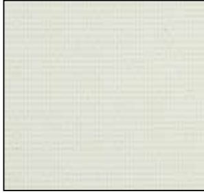
No-Lite Fiberglass Solid White 011