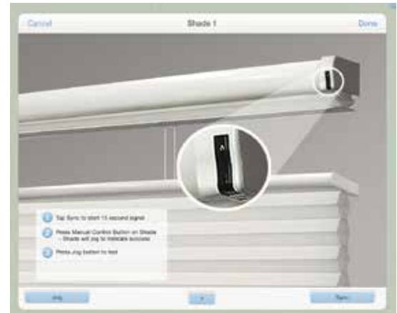
Easy set up using the Momenta App.