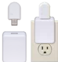
Momenta Extender Kit