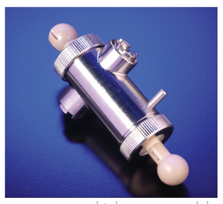
multiplex pump module

IVEK's ceramic piston/cylinder modules are extremely hard and resist abrasion, resulting in a system that exhibits little to no wear even after hundreds of millions of cycles. In addition, the ceramics are compatible with most acids and bases. The natural crystalline structure of the ceramics displays zero porosity, which insures zero retention and carry-over of one biological fluid to the next.