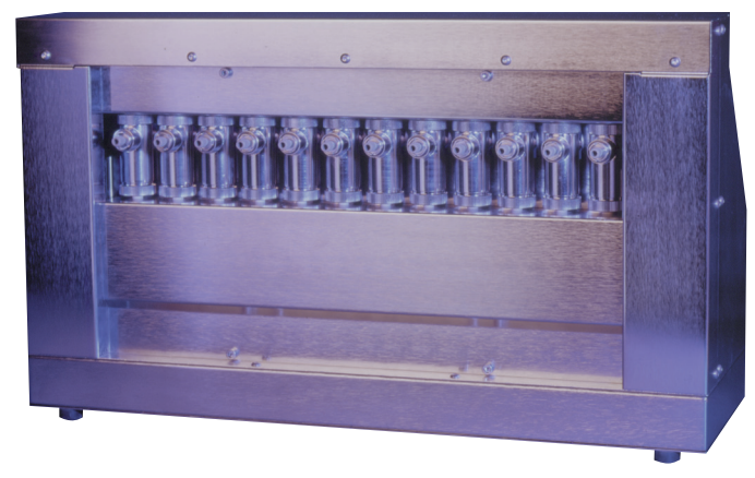
large frame 12 channel multiplex actuator 66.2cm x 23cm x 41cm