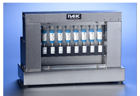
small frame 8 channel multiplex actuator 41.8cm x 21.6cm x 33.5cm

IVEK'S Multiplex dispensing system provides controlled multiple channel precision dispensing for applications where simultaneous delivery of fluid is desired. The system features a high-resolution servo controlled actuator that can control up to 12 ceramic pump modules at once. Each module is a positive displacement mechanism that includes precision ceramic pistons that are mated with ceramic cylinders. Standard clearances are tight enough to eliminate the need for secondary seals. Custom seals and clearances can be included, as each application requires. The individual piston/cylinder sets also include a separate ceramic rotary valve that is individually controlled in the system. The result is a three-piece pump module that can be individually enabled/disabled through the control of each rotary valve. This system can deliver volumes from the sub-microliter range up to 4 milliliters in a single stroke. All parameters are digitally selected through an RS232 computer signal or a touchscreen. This system features the ultimate in accuracy and repeatability, and the efficiently engineered design results in an economical per channel price.