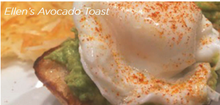
Ellen's Avocado Toast

Two(2) poached eggs on a toasted ciabatta with avocado spread and finished off with a dusting of Paprika. Shredded hash browns. 12.85