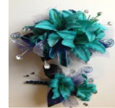
corsage and boutonniere

There are usually a lot of pictures taken before and at prom.