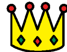
Prom King and Queen

It can be fun to dress up and go out with friends.