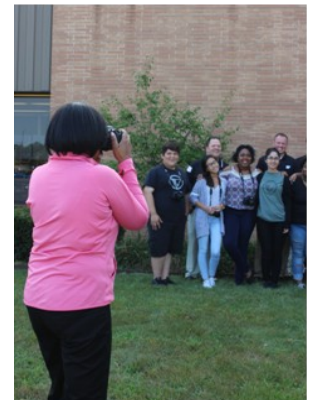
...who then got to practice her new photography skills.