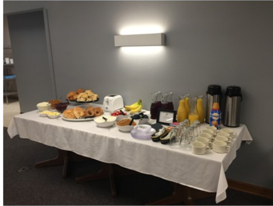
Threshold students prepare a breakfast of champions.