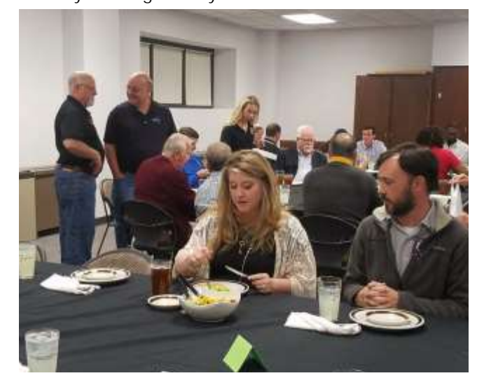
Advisory Board Members enjoy dinner in W301.