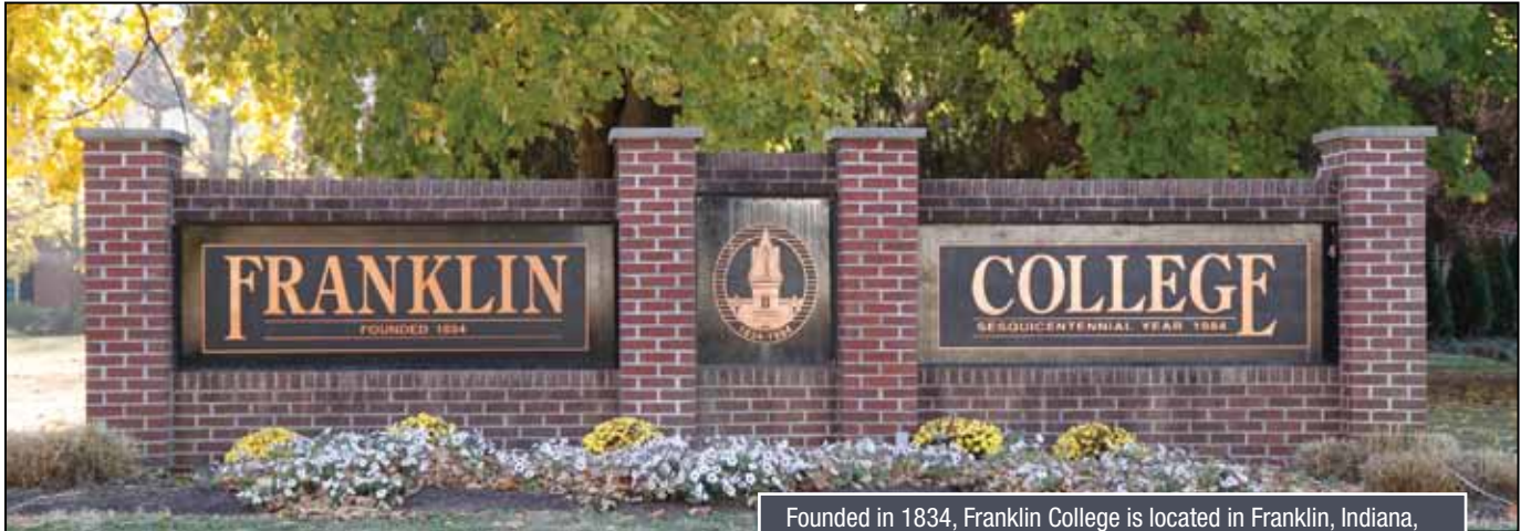
Founded in 1834, Franklin College is located in Franklin, Indiana, about 20 miles from downtown Indianapolis and serves 1,060 students, many of whom live in dorms on campus.