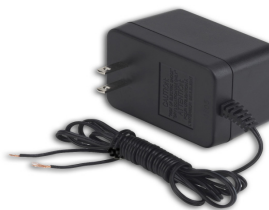
Replacement Adapter 110 VAC, 12 VDC (replaces RPS-1A)