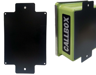
Goose Neck Pedestal Bracket