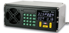
One Piece Model

RCCR Dual Mode Operation is Upgradeable to Tri-Mode Digital Operation.