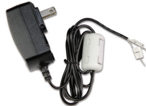
110VAC-12VDC, 1.5A REGULATED.