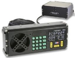
Two Piece Model

RCCR Dual Mode Operation is Upgradeable to Tri-Mode Digital Operation.