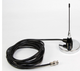
VHF/UHF Mag Mount with BNC, Antenna, 25 Ft Coax Cable