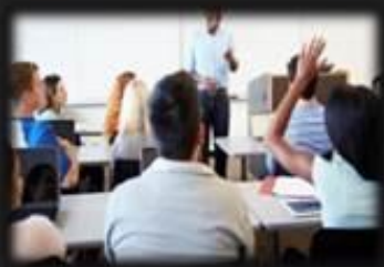
HOMEOWNERSHIP AND DEBT MANAGEMENT

SPACE IS LIMITED SO PLEASE REGISTER TODAY!