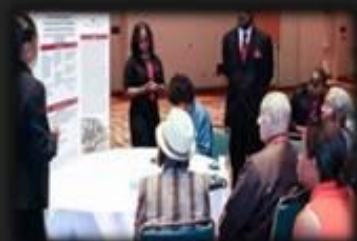
COLLEGE READINESS AND UNDERSTANDING K – 12 EDUCATION