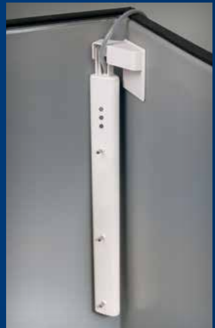
Bin Level Control Sensor