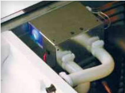
LuminIce Growth Inhibitor accessory

antimicrobial protection. Foodzone edges have rounded corners that wipe cleaner, easier. Our optional Automatic Cleaning System (iAuCS®) initiates a cleaning or sanitizing cycle to the evaporator AUTOMATICALLY at an interval you select, extending the time between full service cleanings. And Manitowoc's exclusive LuminIce® Growth Inhibitor accessory creates "active air" that passes over exposed foodzone components to inhibit the growth of yeast, bacteria and other common micro-organisms. So your Indigo stays cleaner, longer. That's intelligent design.