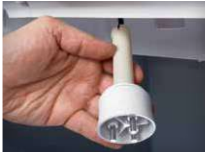
Snap-fit water probe