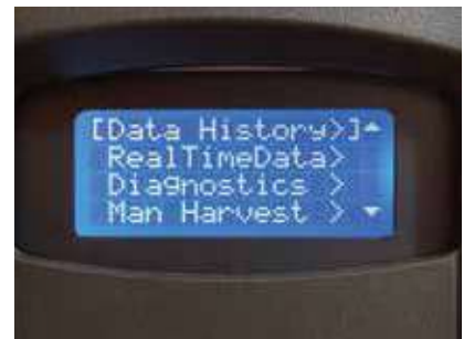
Service data display