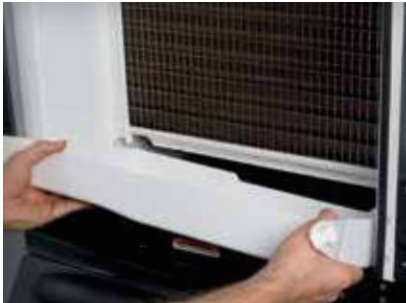
Removable water trough