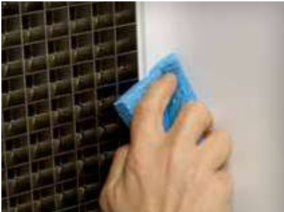
Rounded foodzone corners