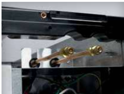
Easy frontal access to service ports