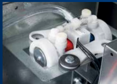
Patented Air Assist Harvest technology