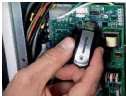
Firmware upgrades through USB port