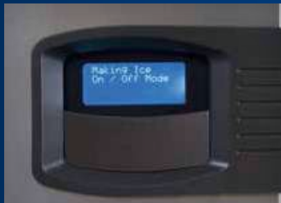
Standard button-cover bezel prevents unauthorized menu navigation in public areas