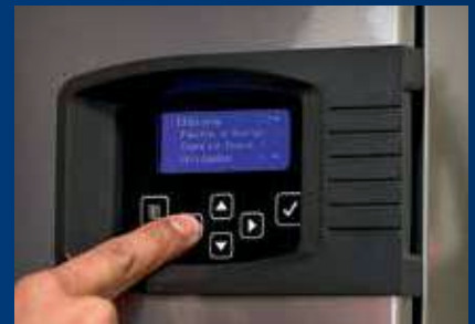
Full access bezel cover for easy access in non-public locations included with every machine