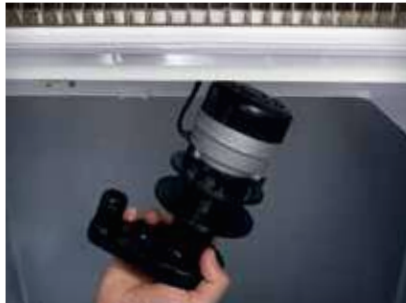
Snap-fit water pump