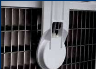
Acoustical Ice Sensor

Manitowoc's patented Air Assist Harvest technology speeds up the ice harvest cycle lowering overall energy use. The revolutionary acoustical ice-sensing technology accurately measures ice thickness for consistent cube formation creating a quality ice cube in less time.