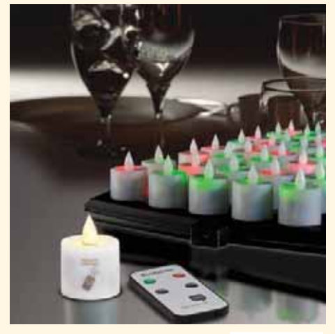
Rebate Available on Evolution Series. Scan QR code for details.