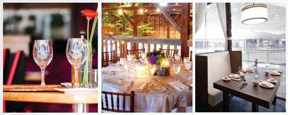
Distinguish Yourself from your Competition

Creative Portable Stove Applications Microwave Myths Must-Have Products and Supplies