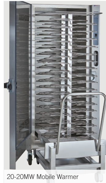
20-20MW Mobile Warmer