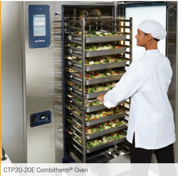
CTP20-20E Combitherm® Oven