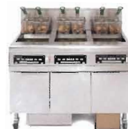
FPGL330 Gas Protector

Saving Potential: >$4,700+ per year/pot!