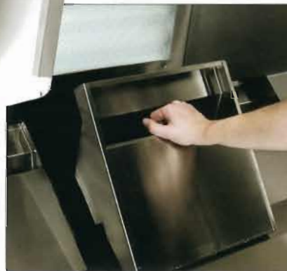
INSIDE FRONT OF HOOD: Easy and safe accessibility to filter medium

Now that's maximizing your energy and cost savings!