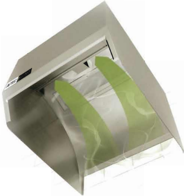
EcoArch Ventilation System Contaminated air is directed to the exhaust slot through the arch top, minimizing turbulence

The arch dramatically reduces the amount of turbulence by directing contaminated heated air into the front location exhaust plenum. In contrast to traditional exhaust hoods, testing indicates that about 70% of the heated air is immediately exhausted out of the reservoir area. The remaining air is directed back by the arch towards the rear of the hood with little or no turbulence until it can be exhausted.