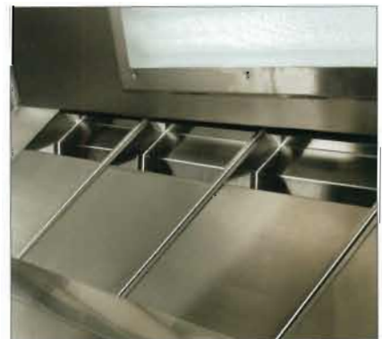
INSIDE FRONT OF HOOD: High velocity exhaust slot allows contaminated air to flow directly into the filter medium

Locating the high velocity exhaust slot as close to the top of the hood as possible allows the arched top to easily direct the contaminated heated air directly into the exhaust plenum. The slot is designed to create a rate of speed faster than the updraft velocities developing from the cooking process. This higher rate of speed, in conjunction with the arch, is the key to successfully capturing contaminated air at very low exhaust requirements.